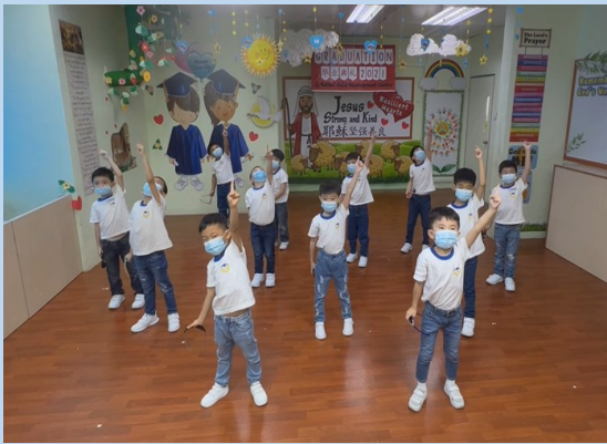
The graduating item “Jesus, Kind and Strong”

课室一瞬间就变成了录影棚。老师们精心的布置毕业典礼的背景，一点也不马虎。今年的主题是“Resilient Hearts 强韧的心”。我们希望孩子们有着屹立不倒的心，不向困难低头，有着强韧的态度应对着接下来的学习和新体验。当孩子们来到幼儿园时，还是个小不点。转眼间，他们快离开我们进入新的学习领域和小学生的生活了。幼儿园给了你一个挡风遮雨的避风港，现在是你展翅高飞的时候了！老师会一直为你打气加油的！