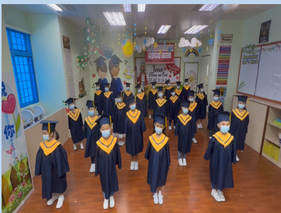
The English item “Never Give Up”