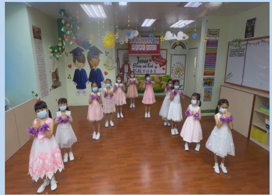
The Chinese item “听我说谢谢你”